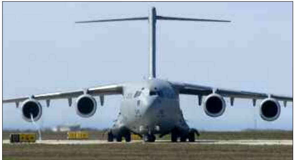
By 2012 eight C-17 Globemaster II aircraft will call WPAFB and the 445th Airlift Wing “home” with the new mission recently announced at the base. The first C-17 is expected to arrive in early 2011 as the 445th prepares for transition from the C-5A Galaxy to its new mission.

oversee our work during the transition period. The Program Integration Office (PIO) will consist of a staff of approximately 10-12 individuals with expertise in operations, maintenance/logistics, facilities, and representation from the Boeing Company. The office will work directly with AFRC, AMC, and our 88th ABW host to smoothly transition our wing from the C-5 to the C-17 mission.